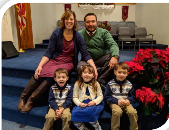
CHRISTMAS EVE AT OUR SENDING CHURCH, FBC GROVE CITY